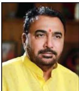
Shri Prataprao Jadhav

The Institute is fully funded by Ministry of Ayush, Govt. of India. The authorities and the officers of the Institute are - The President, The General Body, The Governing Council, The Director and such other committees, sub- committees, authorities and officers as may be appointed by the Governing Council, e.g. Standing Finance Committee, Scientific Advisory Committee, Academic Committee etc.