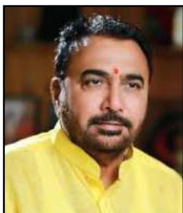
Shri Prataprao Jadhav

The Institute is fully funded by Ministry of Ayush, Govt. of India. The authorities and the officers of the Institute are - The President, The General Body, The Governing Council, The Director and such other committees, sub- committees, authorities and officers as may be appointed by the Governing Council, e.g. Standing Finance Committee, Scientific Advisory Committee, Academic Committee etc.