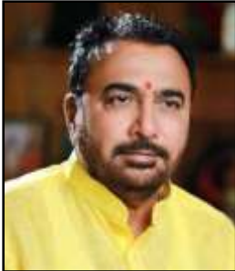
Shri Jadhav Prataprao Ganpatrao Hon'ble's Union Minister of State for Ayush (Independent Charge)

The Institute is fully funded by Ministry of Ayush, Govt. of India. The authorities and the officers of the Institute are - The President, The General Body, The Governing Council, The Director and such other committees, sub-committees, authorities and officers as may be appointed by the Governing Council, e.g. Standing Finance Committee, Scientific Advisory Committee, Academic Committee etc.